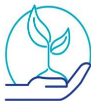
Land Resources Division (LRD)