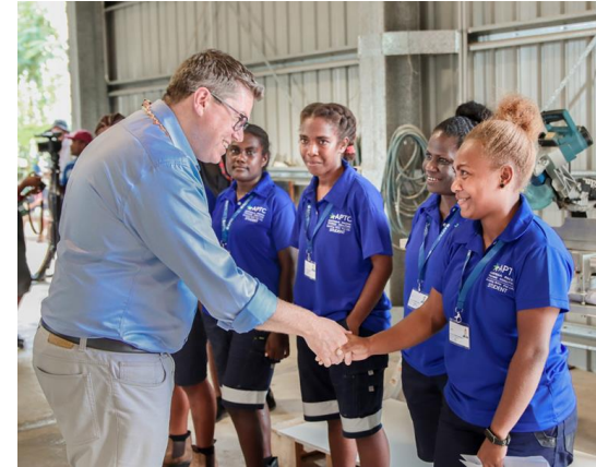
Australian Minister for International Development and the Pacific meets APTC students in the Solomon Islands (July 2023)