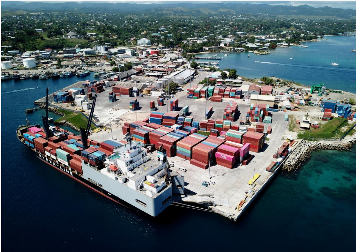
Port of Honiara