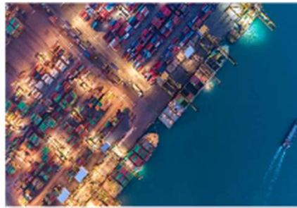
UN Global Survey on Digital and Sustainable Trade Facilitation