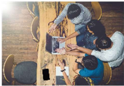
E-Learning Series on Business Process Analysis for Trade Facilitation