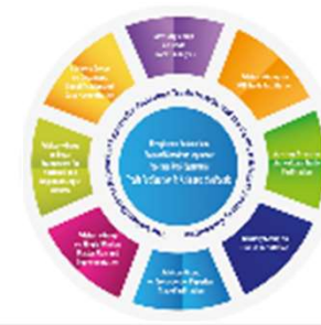
United Nations Network of Experts for Paperless Trade and Transport in Asia and the Pacific (UNNEX-T)