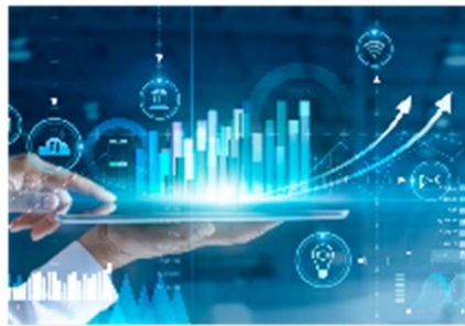
Cross-Border Paperless Trade Readiness Assessment