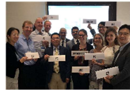
Regional Organizations Cooperation Mechanism for Trade Facilitation (ROC-TF)