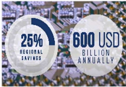
Framework Agreement on Cross-Border Paperless Trade