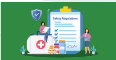
Safe for consumers

Technical standards set requirements for how products are made, tested, packaged, or labelled. These standards help ensure products are: